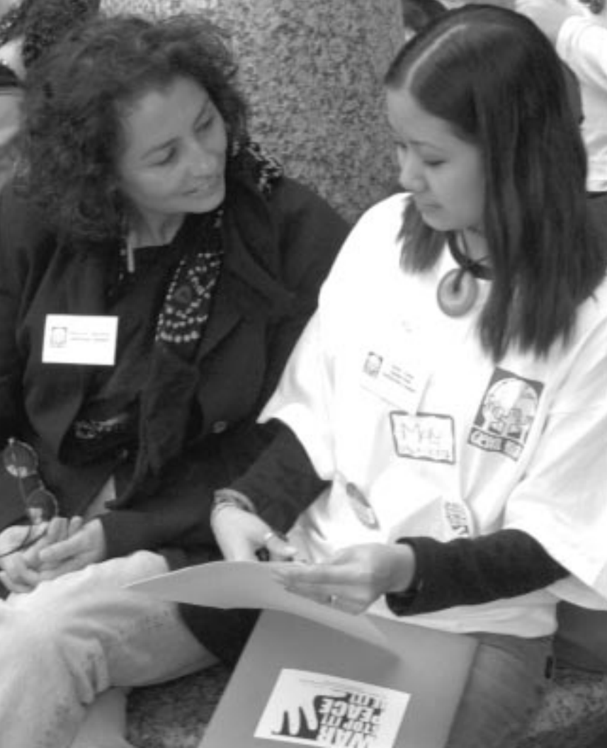
Global Kids, Inc.