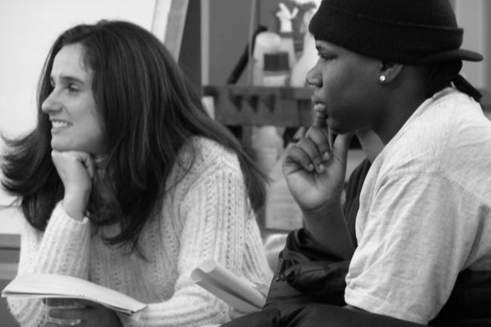
United Neighborhood Houses Citywide Teen Council members from Goddard Riverside Community Center

also important emphases in Harmony Center's programming. Older youth were encouraged to participate in the Youth Council—a group that plays an advisory role with the executive director and board—as well as to tutor younger children. Youth from Harmony Center were also engaged in a community clean-up campaign with youth from a local synagogue, testified at public countywide hearings, and participated on local councils and committees. Lastly, although Harmony Center provided plenty of activities and ample opportunity to work with adults, it also gave children unstructured time in which they could simply be children together.