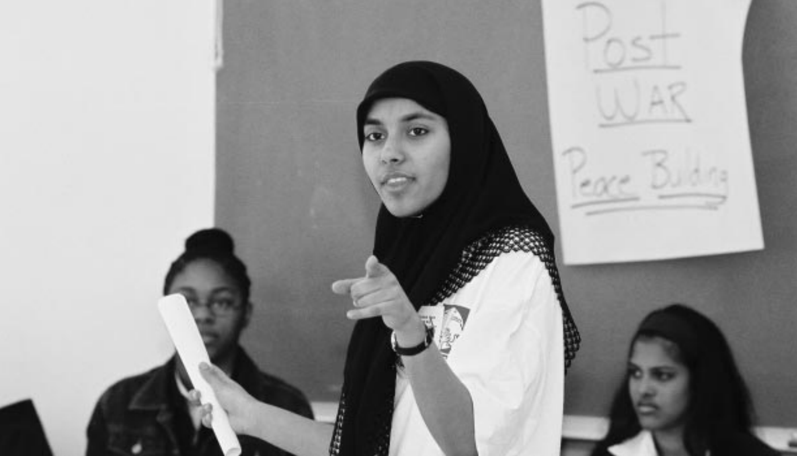
Global Kids, Inc.

When I discussed the case of the Vanhold school district with an OCR officer, I put forward the perception I had heard mentioned by parents and staff that BOCES created obstacles to keep children from being mainstreamed out of special education and placed back into the district. The officer, an African-American woman, responded, “BOCES teachers are convinced . . . that children will not function well in a regular classroom. They have lowered their expectations of these children” (personal communication, May, 2000). She mentioned that the state is now beginning to offer incentives for districts to remedy over-referral to special education, encouraging them to bring children back into the district by offering money for smaller classes and resources for earlier academic intervention.