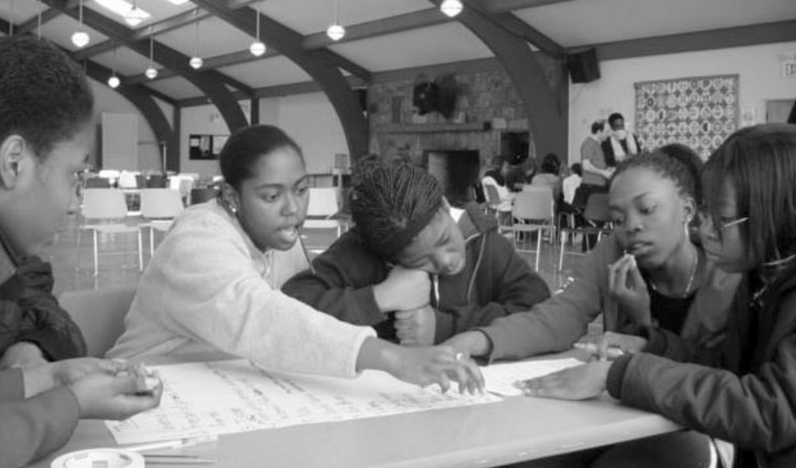
Global Kids, Inc.