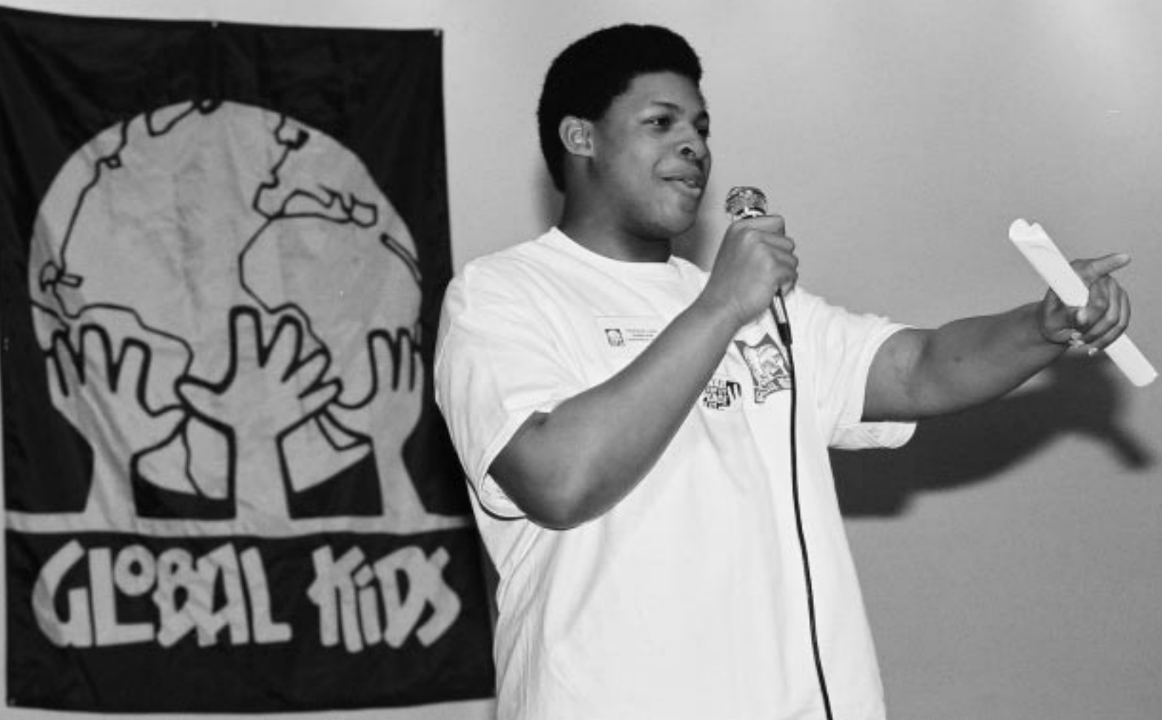
Global Kids, Inc.

days, teachers see that, you can't focus, they automatically call your mother. When I was in school, my mother never got called. They just passed you through, you didn't have special nothing. (personal communication, April 14, 2000)