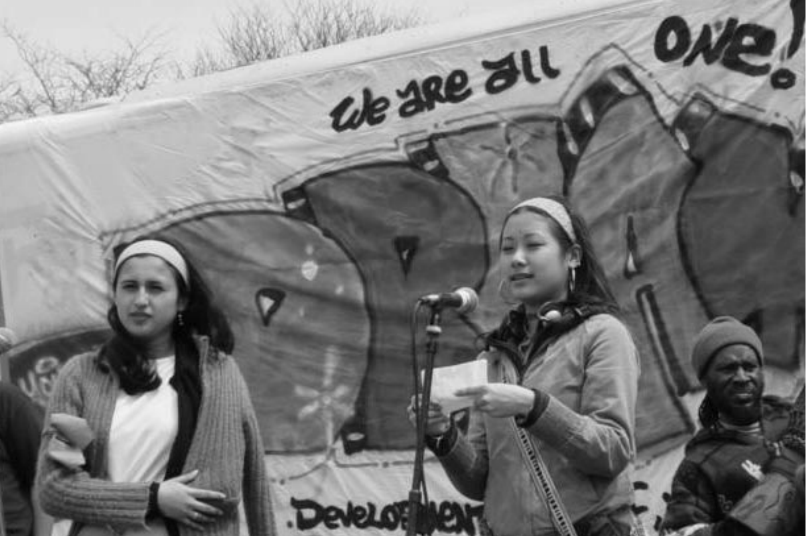
Global Kids, Inc.

Education Office for Civil Rights (OCR) report. The OCR had investigated the school district's practices in referring children to special education. The report found that the enrollment of African-American and Hispanic students in special education was disproportionately high, with such children often being sent to the "most restrictive" settings in BOCES (the Board of Cooperative Educational Services), a vocational high school outside Vanhold. The school district had to redress its practice of over-referring children of color.