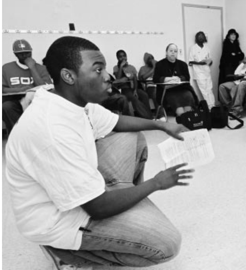
Global Kids, Inc.

Harmony Center, a comparatively small CBO with an average of 65 children attending daily during the year of my study, is located in Vanhold, a suburb of a large city in the Northeast. At the time of my study, Vanhold had 28,578 residents, most of whom, 82.5 percent, were of European descent, with African Americans making up 2.8 percent, Asian/Pacific Islanders 10.9 percent, and Hispanics, the fastest-growing group, 13.2 percent of the population (U.S. Census, 2000).