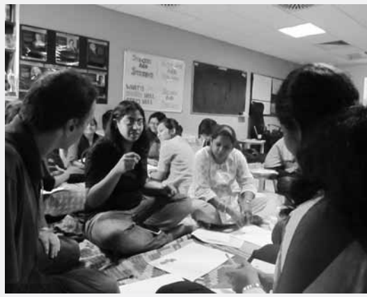
Above: With 24 and 19 participants in Mumbai and Pune cities, respectively, the first SEED seminar was held in August, 2014.